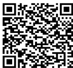
NSPCC Parental Controls guide